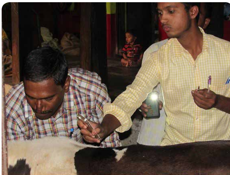
Testing for tuberculosis in animals by injecting tuberculin by veterinary doctor with assistant.

“A Study on Drugs for Treating Anaemia” by DAF-K examines the sorry plight of the poor people in India with regard to access to medicines for treating anaemia. On the one hand drug companies are marketing irrational formulations while essential and cheap medicines to treat anaemia are not available in the Indian market. Doctors are compelled to prescribe such irrational medicines because of the absence of useful medicines in the Indian market. There are preparations of iron with vitamin C, with vitamin B12, with Magnesium – all of them heavily promoted by drug companies. The most popular brand is FEFOL, which is in capsule form and standard text books mention that it is wrong to administer iron in capsule as iron gets absorbed in duodenum (the first part of small in-