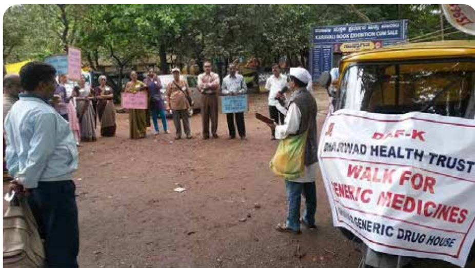
Walk for affordable medicines